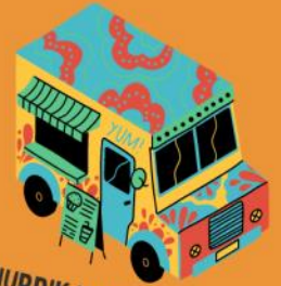
HURRIKANE'S FOOD TRUCK

FOR MORE INFORMATION, CONTACT ANN HALE AT FAMILYMINISTRY@BROADWAYBAPTIST.ORG