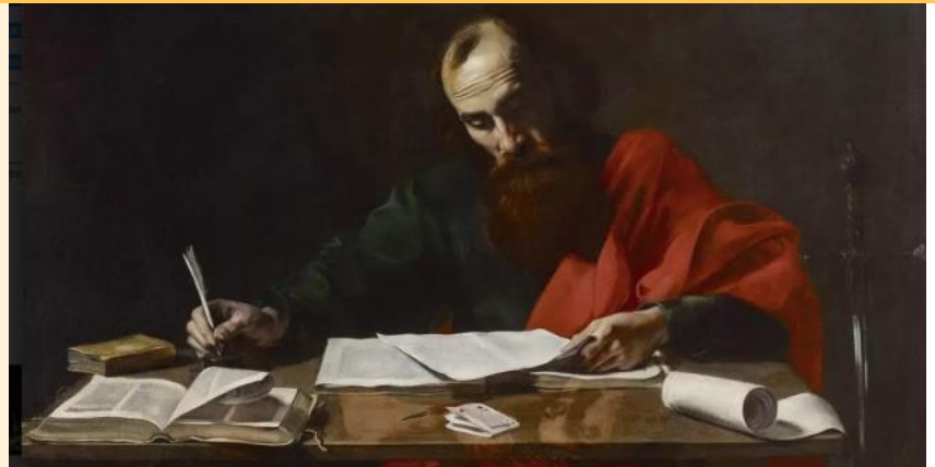
Valentin de Boulogne, Paul Writing His Epistles, 17th Century

"I want you to know, beloved, that what has happened to me has actually helped to spread the gospel, so that it has become known throughout the whole imperial guard and to everyone else that my imprisonment is for Christ..."